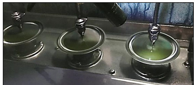
Indigo 40% solution and Sera Con C-RDA